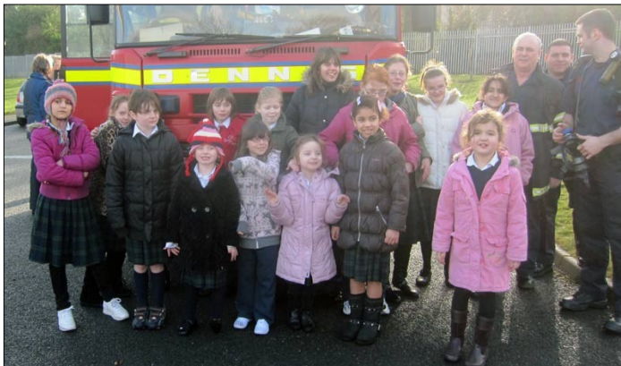
Marian School Girls with the Fire Engine

They arrived in a fire engine. All the girls had a turn using the big hose. A great day was had by all.